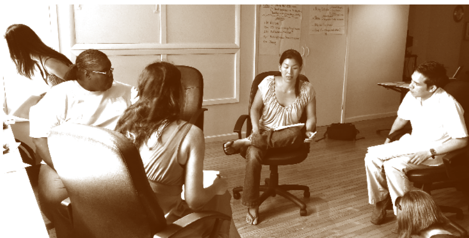
A breakout session from the July 2008 Power Together visioning session for community advisors.

History is calling all of us to step forward and to organize. North Star Fund helps make that possible.