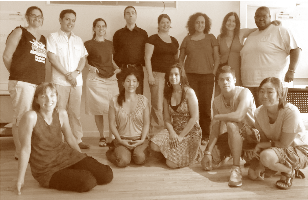
Power Together Community Advisors